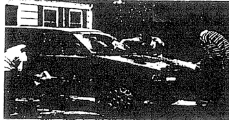
Teens wash cars to raise money for Haiti.

The teens put up signs in their neighbourhood to attract the cars passing by. "It feels great to do something for a good cause," says Angela name , one of the teens involved in washing the cars. the teens say that they plan to give the money to Canadian Red Cross, who will be sending more people to Haiti later this month.